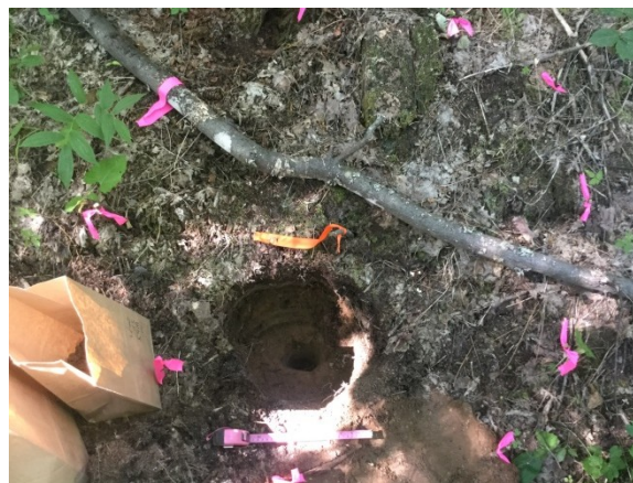
Fig. 17. Microplot sampling. The plants, fine woody debris, forest floor, and two layers of mineral soil have been collected.

Mineral soil was collected from the microplots in approximately 10-cm diameter holes at depths of 0-15 cm, 15-35 cm and 35-55 cm. The volume of each sample was measured in the field by lining the excavated holes with plastic and using a graduated cylinder to measure the volume of water that filled the hole. The mineral soil samples were oven-dried, weighed, and percent carbon and nitrogen was determined.