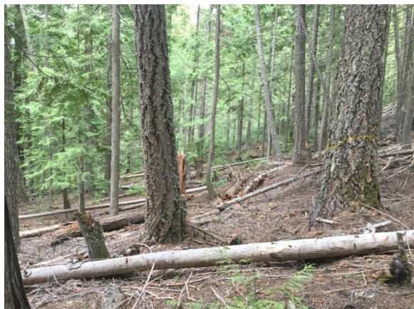
Fig. 7. Redfish Creek. Douglas-fir mixed with western redcedar and other species; cedar regeneration and patchy understory plants.