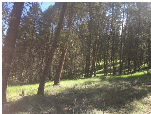
Fig. 5. Peterhope Lake. Multi-layered nearly pure Douglas-fir.