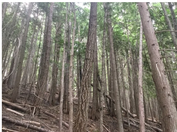
Fig. 8. Narrows Creek. Dense Douglas-fir, western redcedar, western hemlock, and western larch with sparse understory trees and plants.