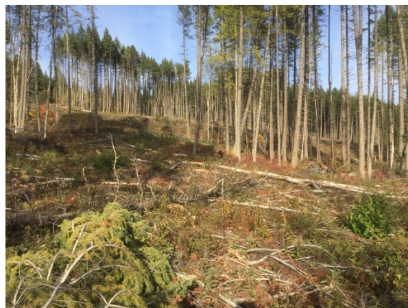
Fig 14. 30% group retention.