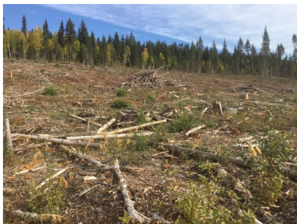
Fig. 12. Clearcut.

Logging has been completed at six of the nine locations and is planned for late 2019 at the other three. Leave trees and residual patches were marked out prior to harvest. Figures 12 to 15 illustrate the four silviculture systems at the John Prince site.