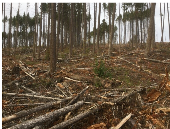
Fig 15. 60% retention with thinning.