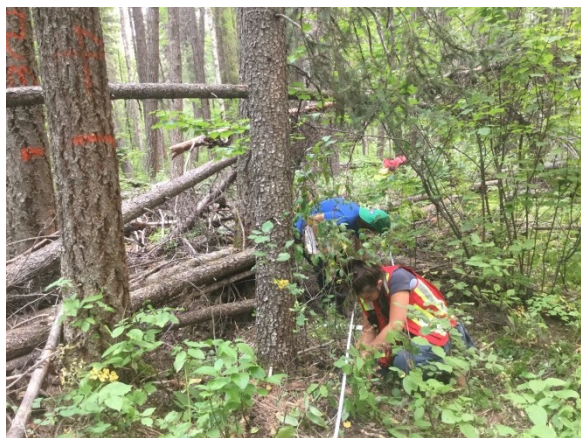
Figure 16. Sampling forest floor along the CWD transect.

One circular 1 m 2 (r=0.56 m) microplot was established at each end of the 30 m transects (total four microplots per NFI plot). Within each microplot, a 20 x 20 cm sample of forest floor extending from the ground surface to the mineral soil interface was collected. Samples were oven dried and weighed in the lab and analyzed for percent carbon and nitrogen content. All bryoids, herbs, trees/shrubs ≤1.3 m in height, and fine woody debris (<1 cm diameter) were collected from the microplots, oven-dried and weighed.