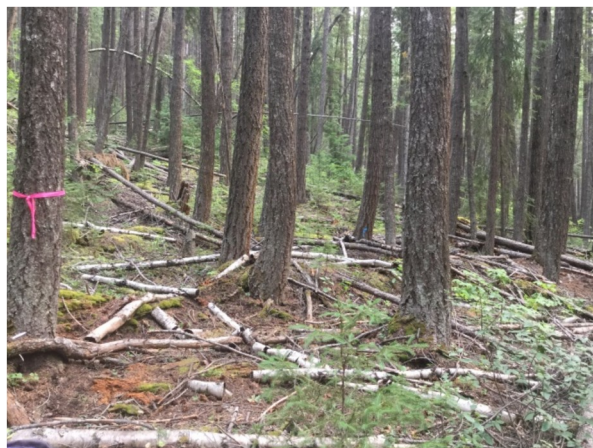
Fig. 10. John Prince. Douglas-fir with a minor spruce component and patchy understory subalpine fir and plants.