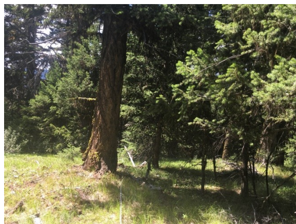
Fig 4. Venables. Multi-layered pure Douglas-fir dominated plant layer.