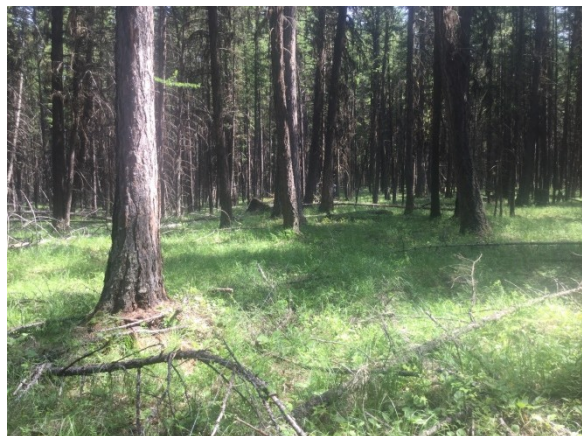
Fig. 3. Jaffray. Moderate-sized Douglas-fir with a minor western larch component, sparse understory regeneration and a pinegrass-dominated plant layer.

The interior sites are in the Interior Douglas-fir (IDF), Interior Cedar-Hemlock (ICH), and Sub-Boreal Spruce (SBS) biogeoclimatic zones and the coastal one is in the Coastal Western Hemlock (CWH) zone. The selected sites are circum-mesic and before logging were occupied by mature Douglas-fir with varying components of other species.