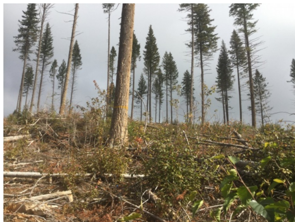
Fig. 13, Single tree retention.