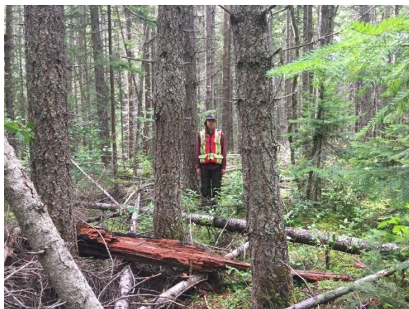
Fig. 9. Alex Fraser (ICH replicate). Douglas-fir with minor spruce component, understory subalpine fir and a lush plant layer.