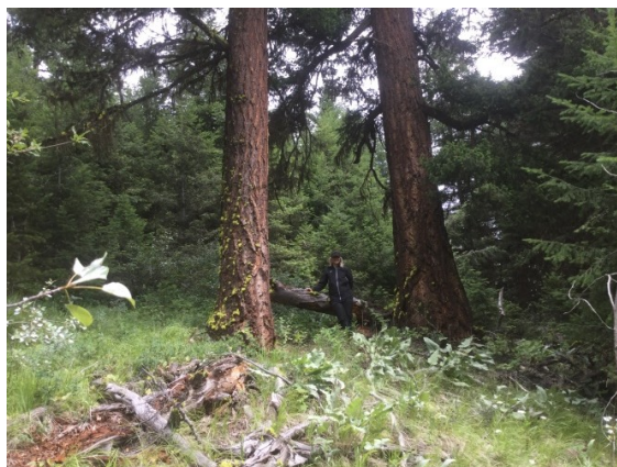
Fig 1. Mother trees at the Venables site.

We sincerely thank all of the people who have worked with us since October of 2015 to get the Mother Tree Project off the ground. We would like to share with everyone what we have accomplished so far as a group.